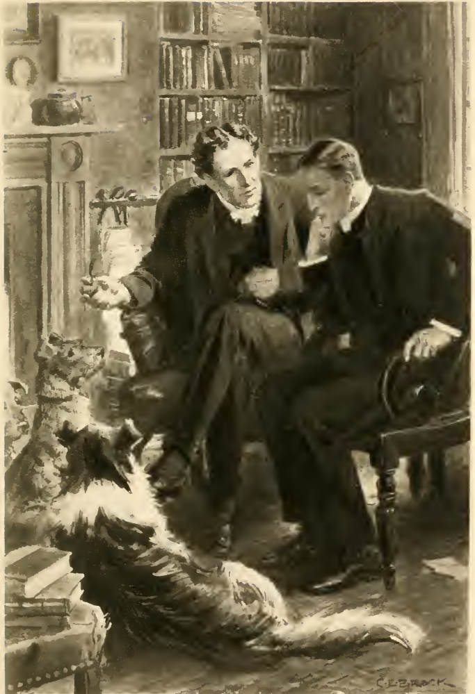
“My dear fellow! No woman ought to marry under nineteen or twenty’”